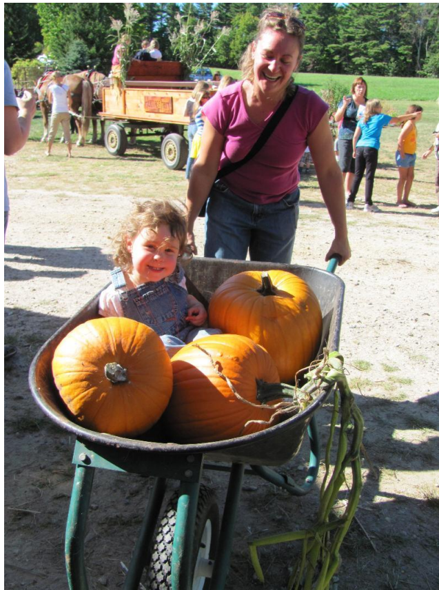
2010 Harvest Festival

K & M Livery (on Facebook only)- providing pony rides