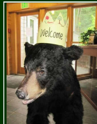
Our mascot welcoming 2011 summer campers!